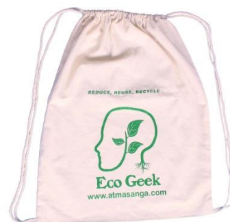
ROPE BAG (Backpack)