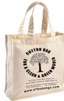
BASIC COTTON GUSSETED BAG