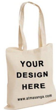
BASIC COTTON BAG

We have a few STANDARD PRINT DESIGNS related to ‘environment issues’ that we PRINT ON ONE SIDE leaving the SECOND SIDE FOR ADVERTISEMENT MESSAGE OF THE BUYER. If the buyer wishes BOTH SIDES TO CARRY their own message it is OK as long as they are willing to PAY EXTRA for Printing Costs. We are also open to suggestions!